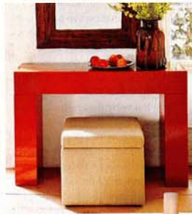
Chunky wood console table in Cinnabar; storage ottoman upholstered in woven jute. Both West Elm.

Dramatic yet practical, this look will make a striking impression.