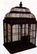
Ornamental black bamboo and wood birdcage, Urban Barn.

Torlys linoleum Uniclick flooring in Azure Blue, available in 12-inch square tiles and 12- x 36-inch planks.