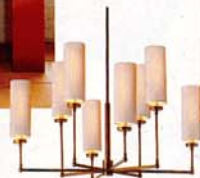
Ziyi eight-light chandelier in hand-rubbed antique brass with natural paper shades, Sesselite.