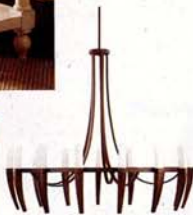
Fifteen-light chandelier in Olde Bronze finish, Royal Lighting.