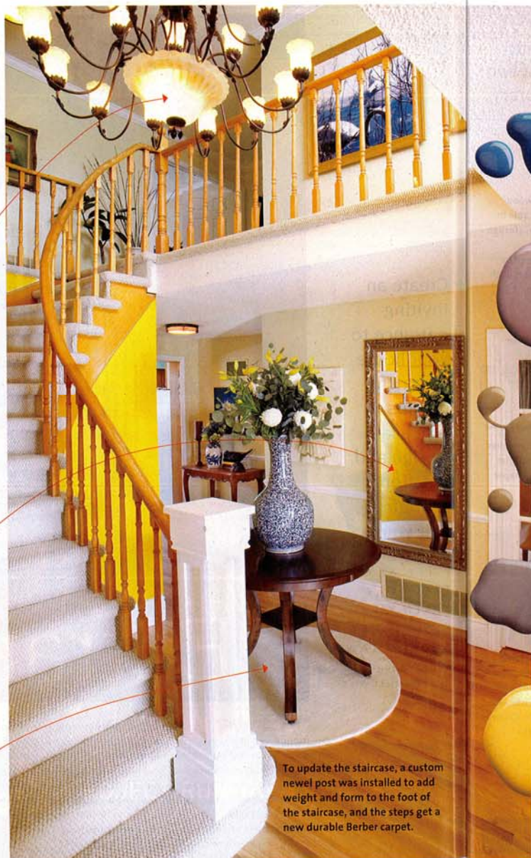
To update the staircase, a custom newel post was installed to add weight and form to the foot of the staircase, and the steps get a new durable Berber carpet.

A table or credenza provides a convenient place to drop keys, cellphones and mail. Ensure that it doesn't impede traffic flow and avoid making it a catchall for whatever gets dragged into the house. A bench and coatrack come in handy, too. The objective is to make your guests' entry as easy as possible.