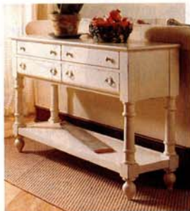
Oyster Bay Collection accent table with one shelf and four drawers in Oyster White, Stoney Creek Furniture.

Durable finishes and casual styling make this look perfect for a busy family foyer.